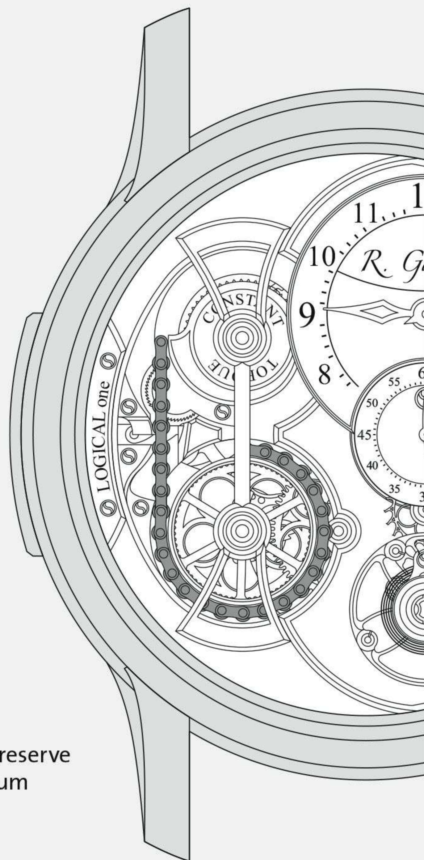
Power reserve minimum